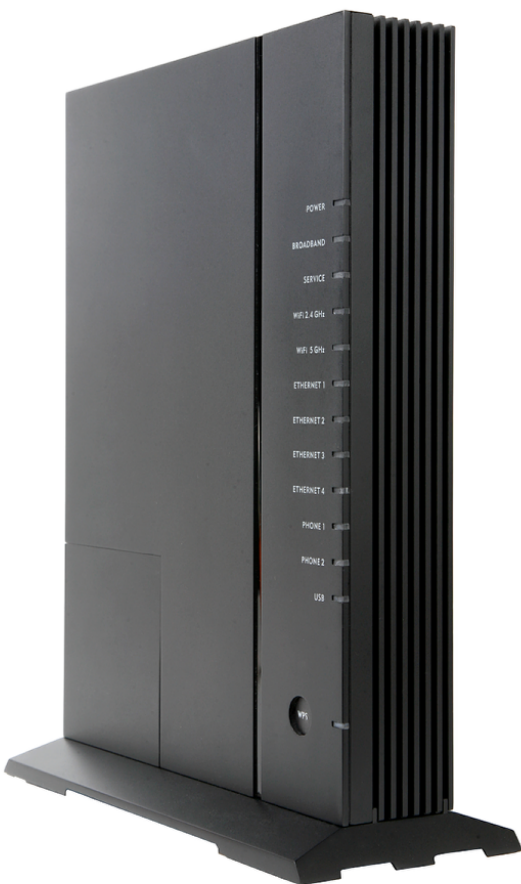
Front of Router